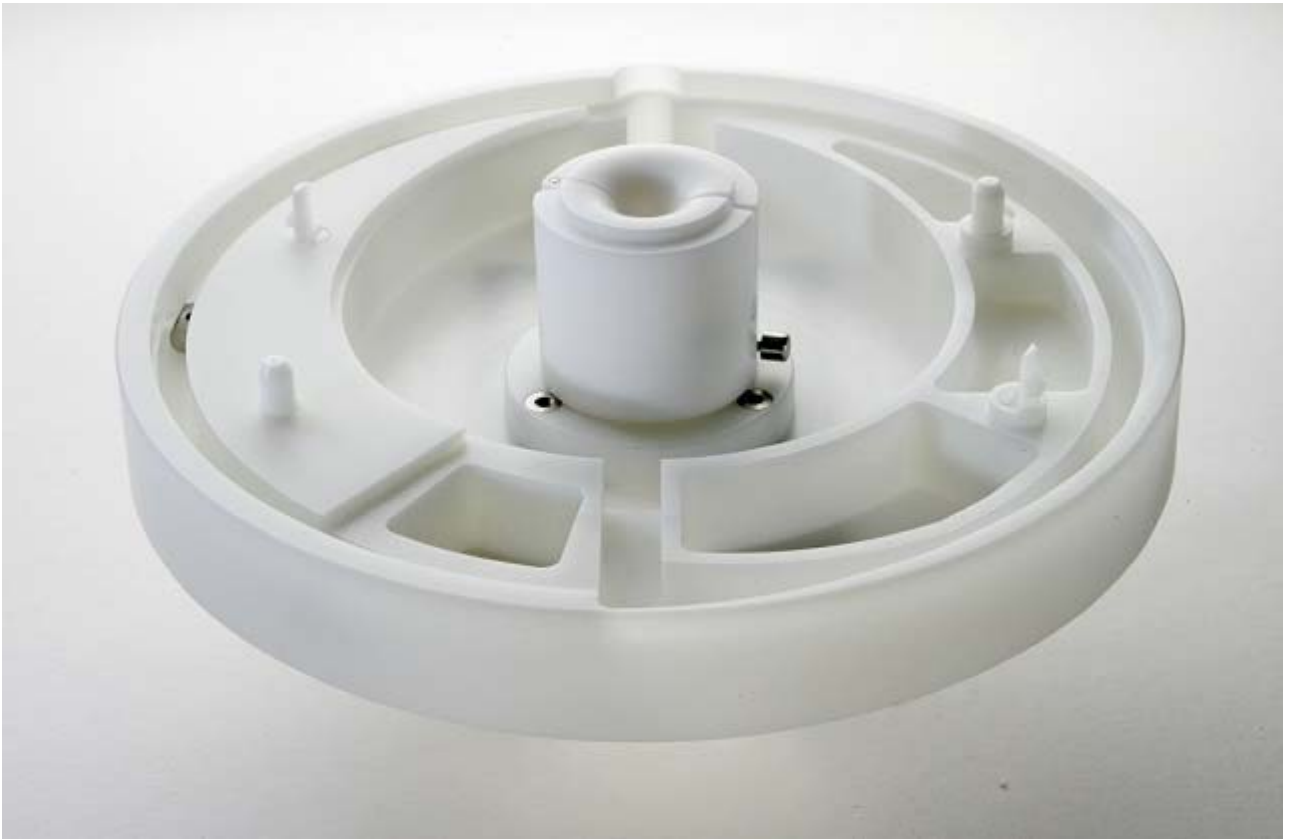
C4 chamber holder