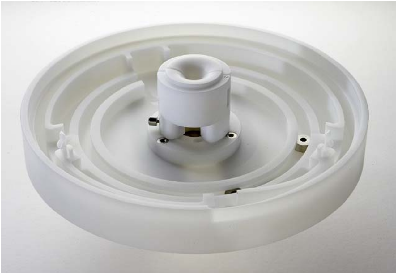
PL1 chamber holder