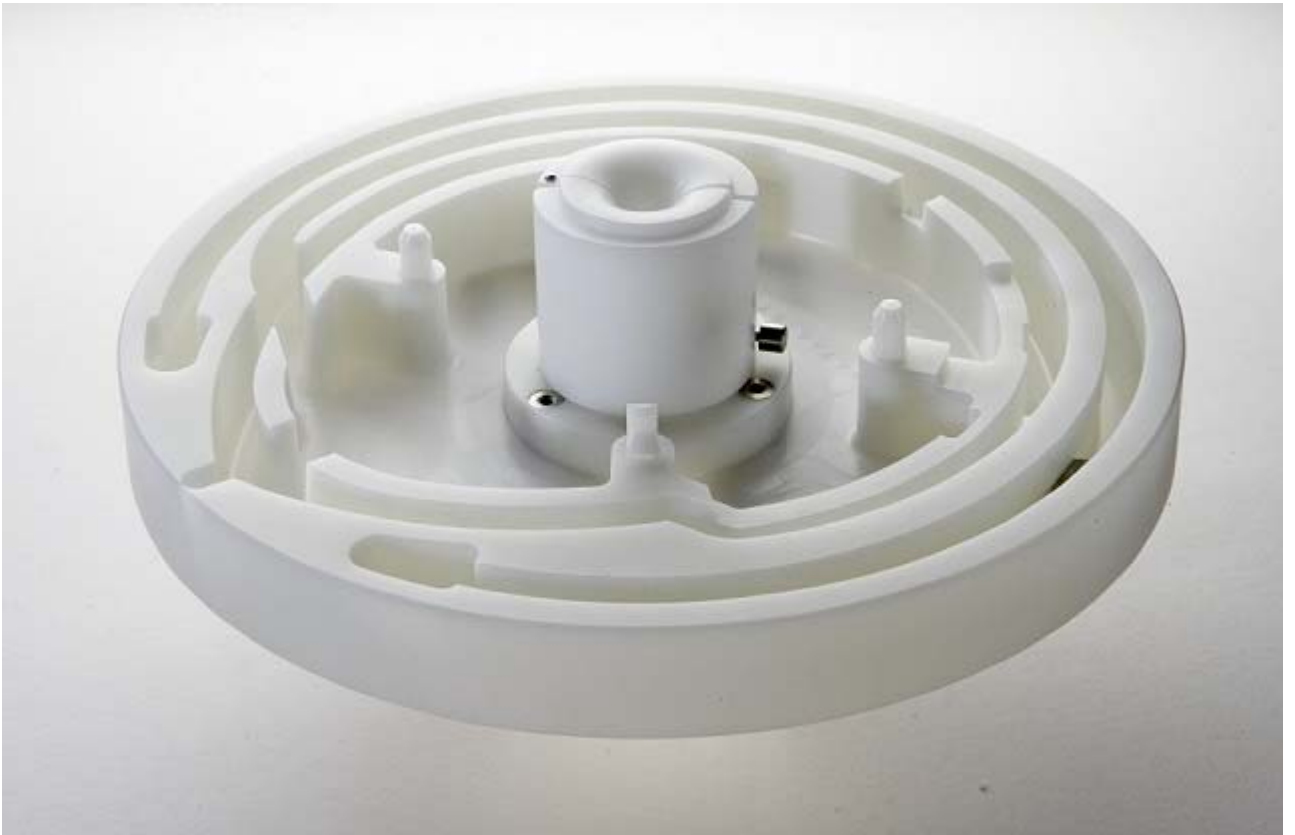
C5 chamber holder